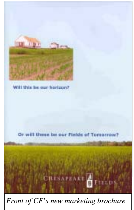
Front of CF’s new marketing brochure

The inside spread introduces icons summarizing CF’s work: research and development; education and Agri-tourism; farming and production and processing and distribution. Look for them in this newsletter.